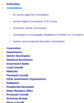
Fig. 14.2: List of organization types for making a complaint.

Once you click on 'Make a Complaint' the following list of organization types will be displayed to the citizen. (Fig. 14.2)